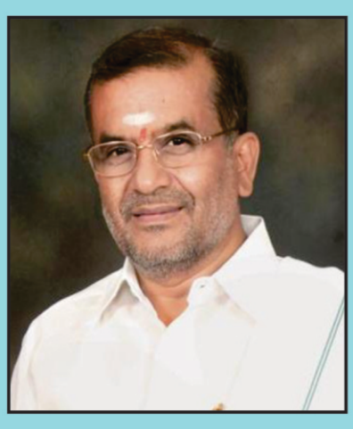
Hon'ble Shri. G. T. Devegowda Pro-Chancellor of Davangere University and the Minister for Higher Education, Government of Karnataka