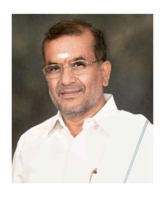
Hon'ble Shri. G. T. Devegowda Pro-Chancellor of Davangere University and the Minister for Higher Education, Government of Karnataka