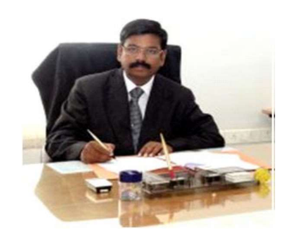
ಪ್ರಕಾಶಕರು : ಪ್ರೊ. ಪಿ. ಕಣ್ಣನ್ ಕುಲಸಚಿವರು ದಾವಣಗೆರೆ ವಿಶ್ವವಿದ್ಯಾನಿಲಯ ದಾವಣಗೆರೆ-577007.