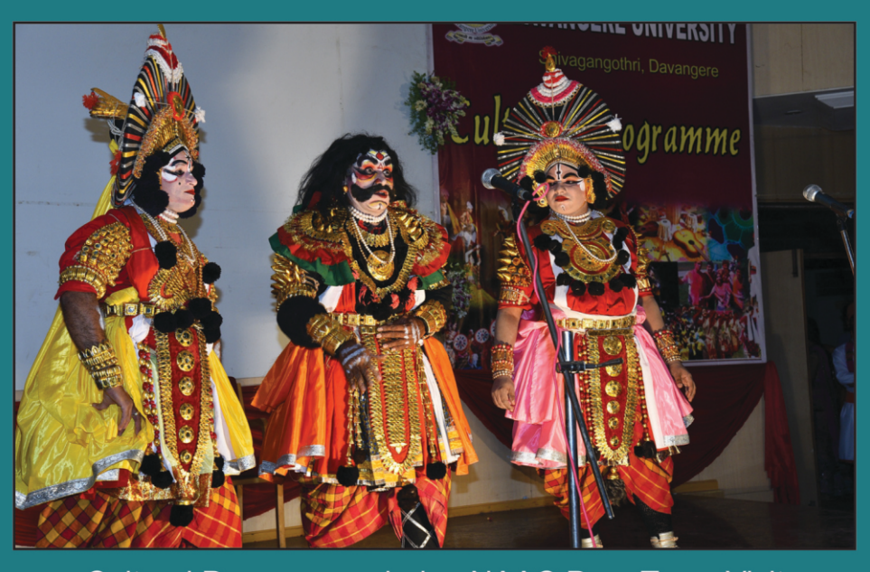
Cultural Programme during NAAC Peer Team Visit