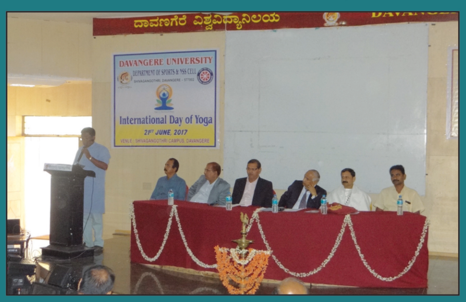
International Yoga Day Programme