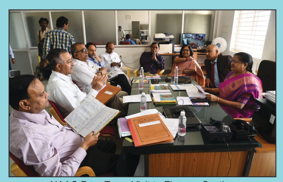
NAAC Peer Team Visit to Finance Section