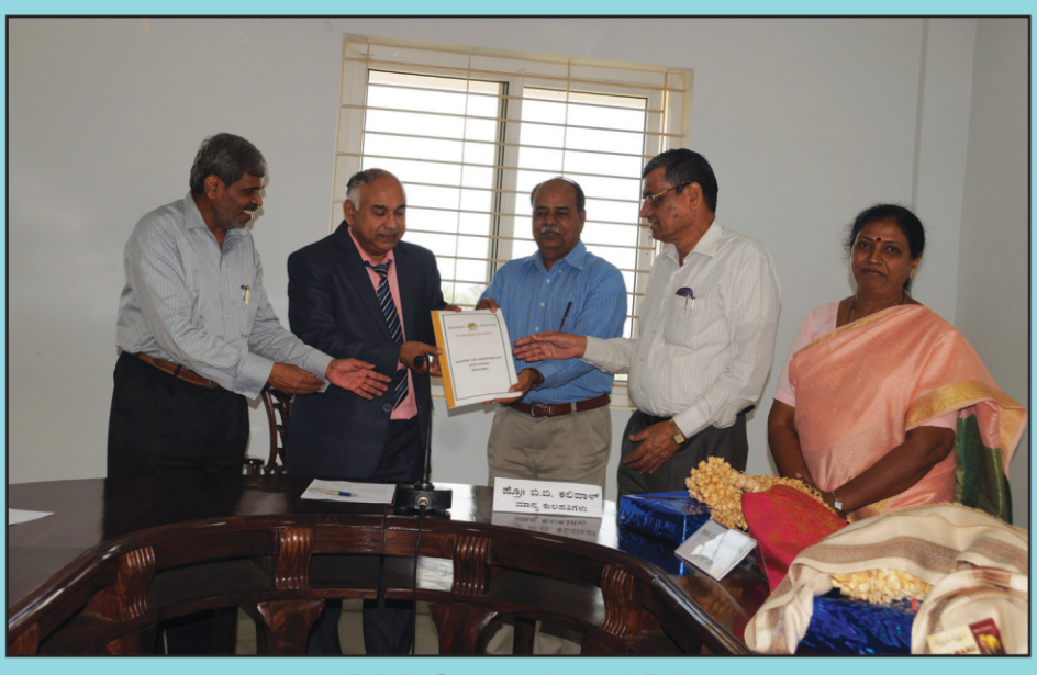
AAA Committee Visit