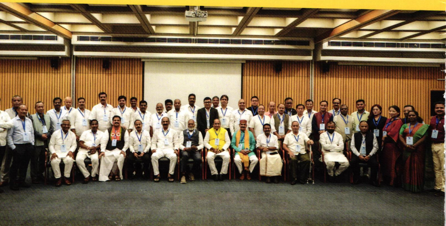
Participants in the PRS National Workshop on Law & Justice in October 2024 in Delhi