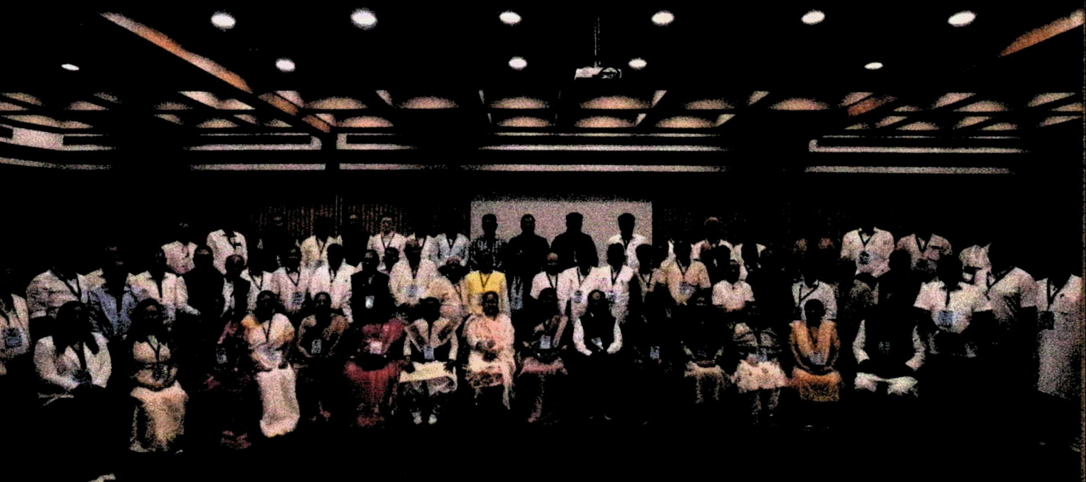
Participants in the PRS National Workshop on Health and Education in July 2025 in New Delhi

In the past, PRS in partnership with premier academic institutions and State Legislatures, has hosted several workshops at the national, regional and state level. It has also anchored programs for Secretariat officials on various legislative and finance topics.