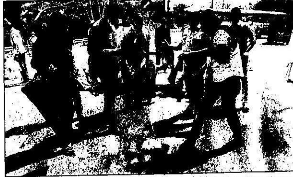
AGRI DISTRESS: Farmers protest in Mysuru on Friday. There have been stirrs against central policies in many parts of the country