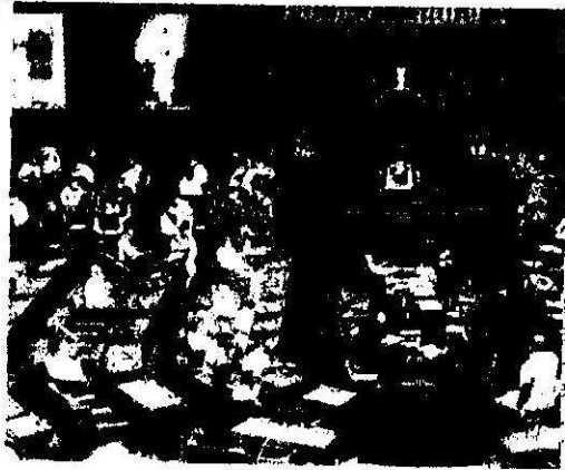
Members of the House on the last day of the monsoon session in Vidhana Soudha on Saturday

Hitting out at Siddaramaiah, the CM said he will resign if charges levelled by the Congress leader are proved. He said it is Siddaramaiah's responsibility to prove the charges and he can go to the CBI, Lokayukta or the high court. "If the charges are proved, I will resign immediately," Yediyurappa said, irked by Siddaramaiah's allegations against his