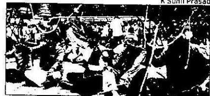
FARM FURY: A demonstration in Bengaluru

Many farmers' organisations have called for a state-wide shutdown on September 28 to demand withdrawal of amend-