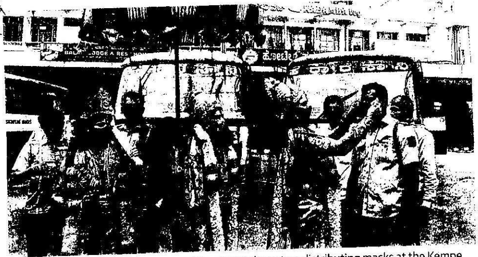
Festival shield: People in costumes of Ramayana characters distributing masks at the Kempe Gowda bus stand in Bengaluru, on the occasion of Ramanavami on Wednesday.

On Tuesday, the High Court said that strike by employees of the four public transport corporations amid the COVID-19 pandemic violated