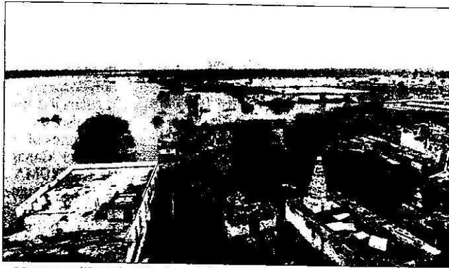
Mannur village in Afzalpur taluk, Kalaburagi district, goes under the floodwaters of Bhima river on Saturday, following a heavy discharge of water from Sonna barrage.

ಪತ್ರಿಕೆಯ ಹೆಸರು : NAME OF THE NEWS PAPER: Deccan Herald ದಿನಾಂಕ : DATE : 18/10/20