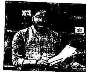
Minister G Kishan Reddy speaks in the Lok Sabha on Tuesday.

"In 2014, out of 47 cases registered, there was one conviction. In 2015, out of 30 cases registered, there was zero conviction. In 2016, out of 35 cases registered, there was one conviction. In 2017,