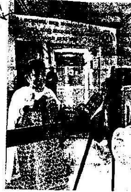
A senior citizen at Sir C.V. Raman General Hospital to get the COVID-19 vaccine.

As many as 331 persons were discharged on Wednesday, taking the total re-