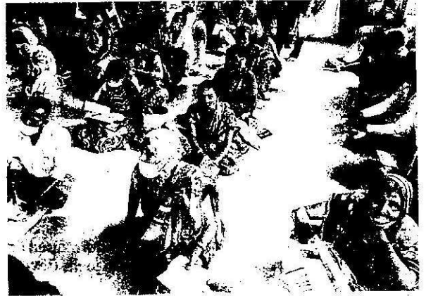
A wait for pensions in Bhubaneswar. *BISWARANJAN ROUT

The panel also pulled up the DoRD for delays and disparities in the payment of wages and unemployment allowances under the flagship MGNREGA scheme.