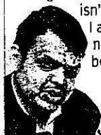
- Devendra Fadnavis Caretaker CM

I will be acting CM until the governor makes alternative arrangements. A re-election isn't desirable. I am sure the next govt will be led by BJP