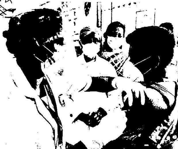
On priority: The vaccination drive opened to healthcare and frontline workers on January 16. • FILE PHOTO

The order further states that there has been a 24% increase in healthcare workers databases in the past few days.