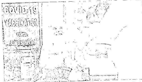
Prime Minister Narendra Modi being administered the first dose of Covid-19 vaccine at AIIMS in New Delhi on Monday.

Prime Minister Narendra Modi, Vice President M. Venkaiah Naidu, Union ministers, chief ministers and senior politicians received their first shot of Covid-19 vaccines on Monday as India began its second phase of vaccination drive.